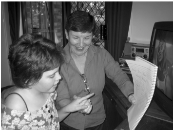
Are you listening?