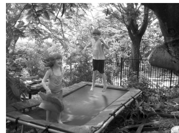
The Rhythm of life